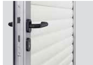
Lever handle set as standard