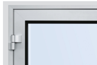
Viewed from inside with synthetic glazing