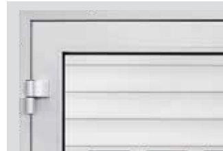
Viewed from inside with 3-way adjustable hinge