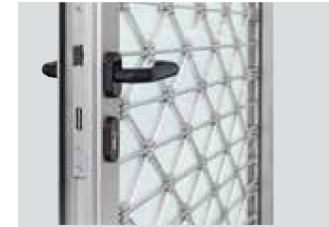
Lever handle set as standard