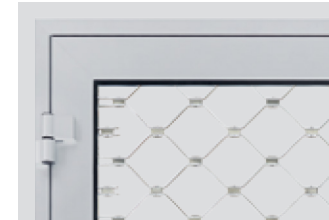
Viewed from inside with 3-way adjustable hinge