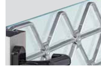
Optional additional synthetic panel provide protection to exclude the possibility of reaching through